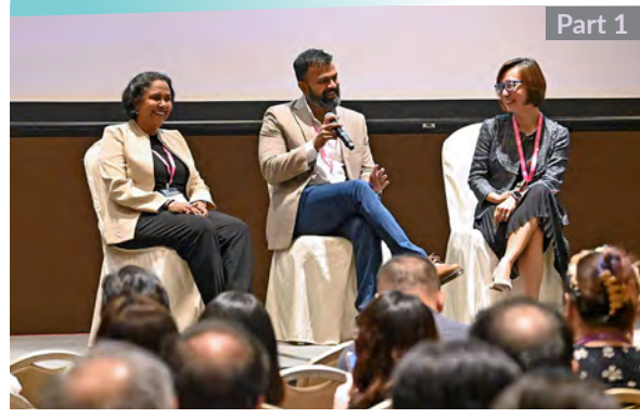
Gen Zs - Understanding the Next Generation of Healthcare Professionals